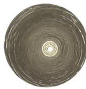
New Reusable Suction Tube