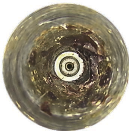
Organic Debris/Blood in Reusable Suction Tube