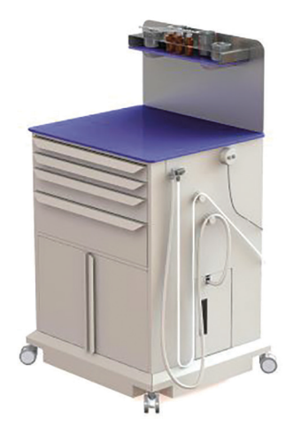
BR900-7509 OTOSMART ENT Treatment Cabinet, 3 drawers, built-in pressure/suction pump, 35¼"w x 36½"h x 19¾"d REBATE $250.00

Take advantage of rebates of up to $350.00 on these durable ENT Cabinets! This is a limited time offer, so contact your BR Surgical Rep today!