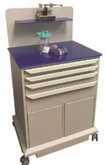
*Work with most manufacturers cabinets *Shown on BR Surgical treatment cabinet

Over 20,000 Surgical Instruments & Procedure Sets • Endoscopic Video Equipment & Related Medical Devices